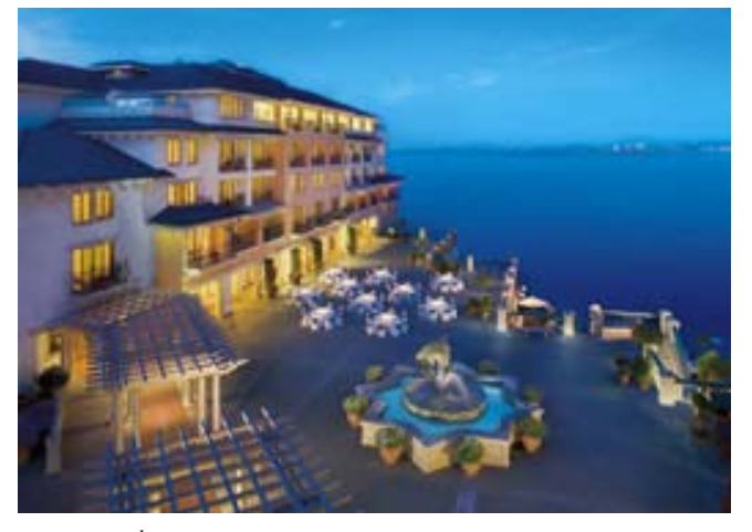
Our 50<sup>th</sup> Annual Meeting Venue: The Monterey Plaza Additional Photos at: <u>www.montereyplazahotel.com</u>

Long-time WRSAers will remember the Plaza as the venue of our 1991, 30<sup>th</sup> Annual Meeting.