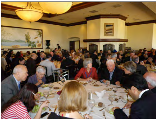
Old friends enjoy a catch-up