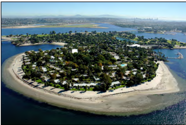
An aerial view of the Paradise Point Resort

Additional Meeting Information... Over the course of the next several months, we will be updating the WRSA website ( www.wrsa.info ) with further meeting details, including travel and program information. Should any questions come up in the meantime, feel free to direct your inquiries to Rachel Franklin ( rachel_franklin@brown.edu ).