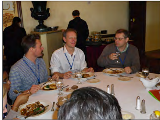
More scenes from the Luncheon...