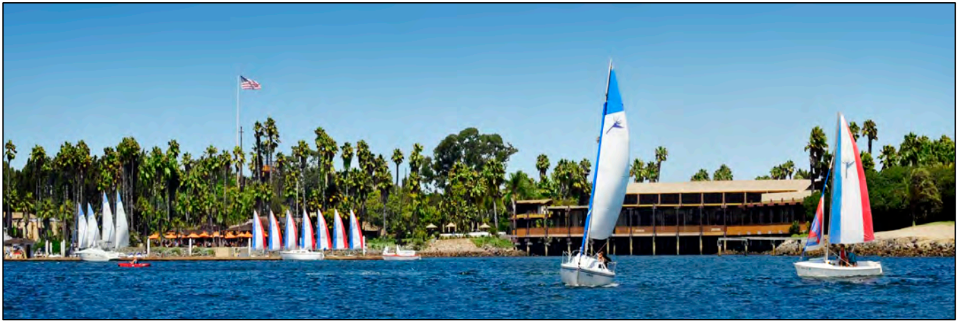
The Paradise Point Resort and Spa