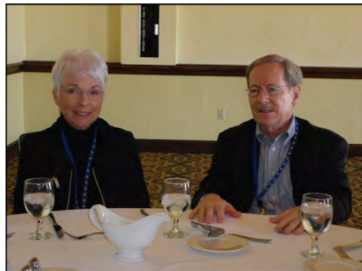
WRSA as a family affair...