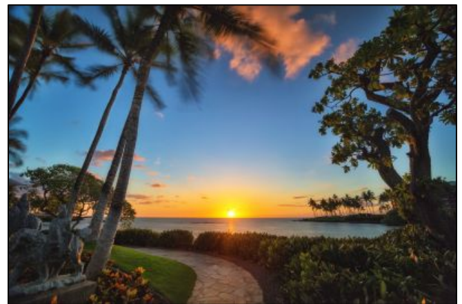
Big Island Sunset

Please preregister. Preregistration for the conference helps us and you: check-in lines move more quickly at the meeting registration desk and we use our preregistration counts to estimate meeting attendance. After January 10, registration fees increase to $400 and $200 for regular and student participants, respectively.