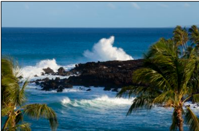
Big Island View

Close your eyes and think of February. Now close your eyes and think of Hawaii in February: warm breezes, sand and sun, perhaps a tropical drink in hand, and... a scholarly meeting. Isn't that really the way academic life should be? And there's still time to attend: in what is quickly becoming a new WRSA tradition, the paper submission deadline has been extended to November 16, 2015 . There's still plenty of time to make the necessary travel arrangements, too. This Newsletter is chock full of preliminary meeting details, everything from schedule overview to room reservation instructions (see pages 2 and 3).