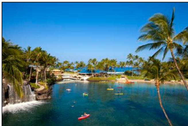
View of the Lagoon at the Hilton Waikoloa