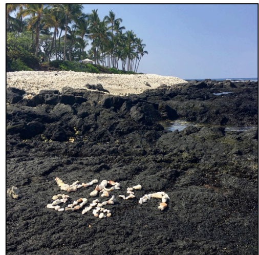
Looking out to sea from the Hilton Waikoloa