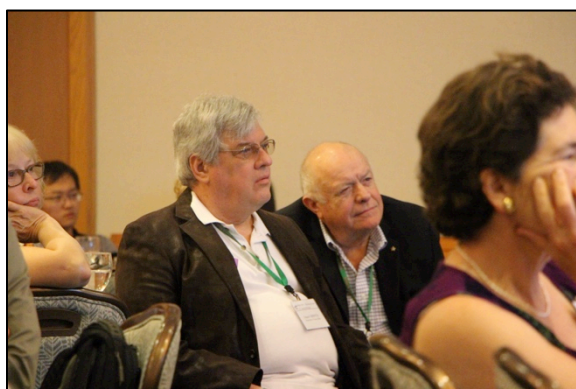
And a few from plenaries and the Annual Banquet Luncheon...