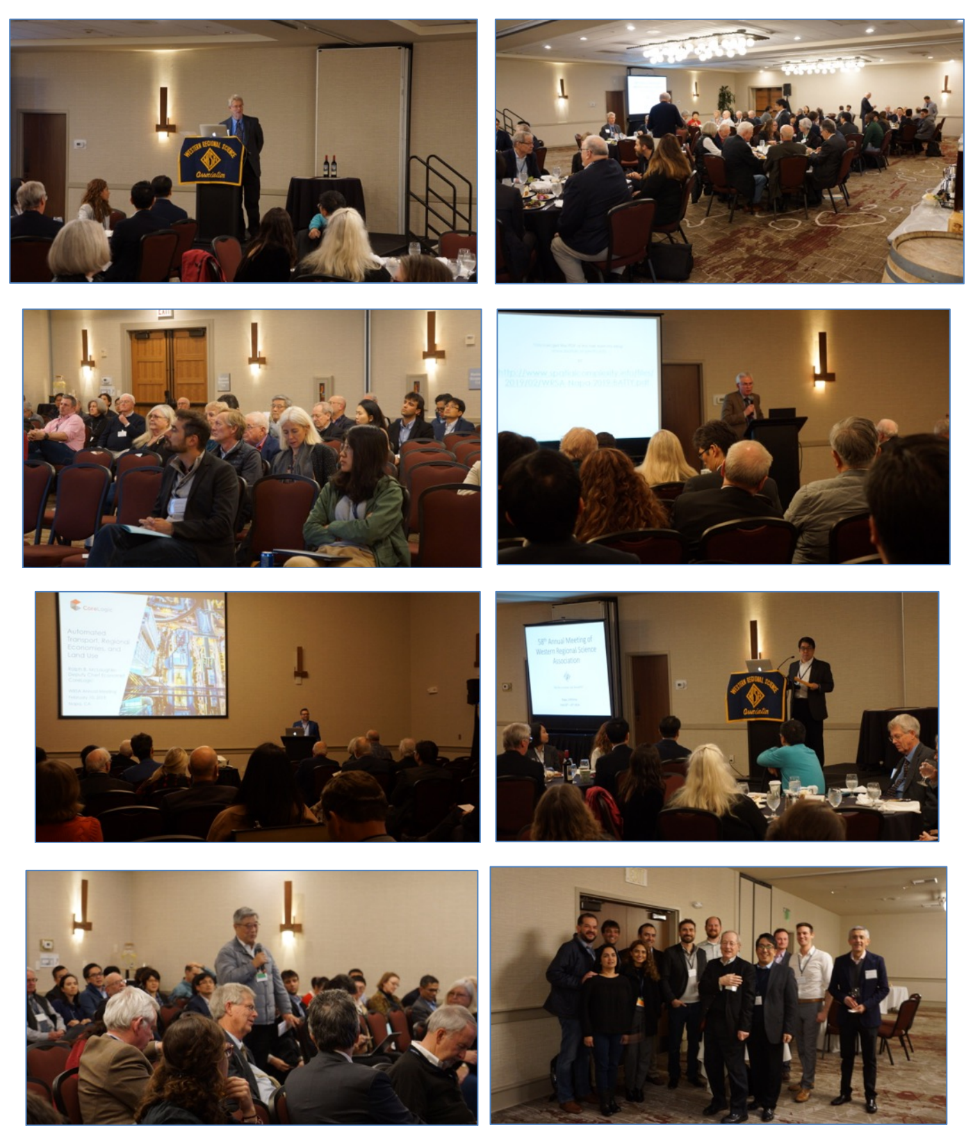
And other assorted meeting photos...